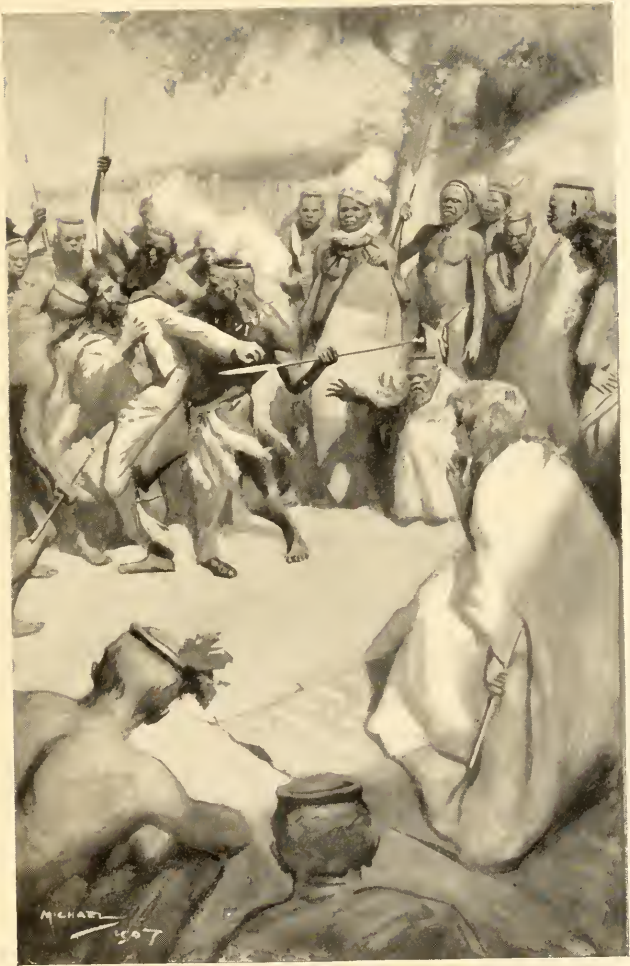
“ The captains . . . seized Ishmael by the arm ” (see page 150).